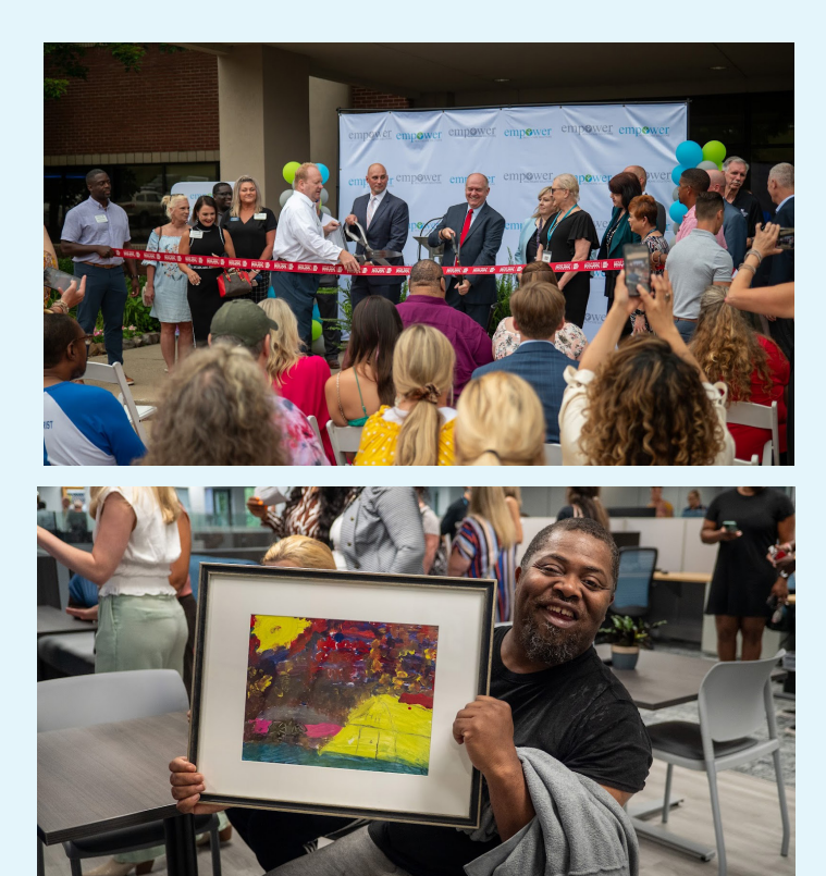
A July 11 grand opening event included a ribbon cutting (top) and the unveiling of member art work that is displayed in the new corporate offices.

The new headquarters features a modern design and amenities to promote team work, innovation and employee well-being. The office space includes open work areas, training and meeting rooms, a conference room and a variety of breakout spaces for staff members to collaborate and share ideas.