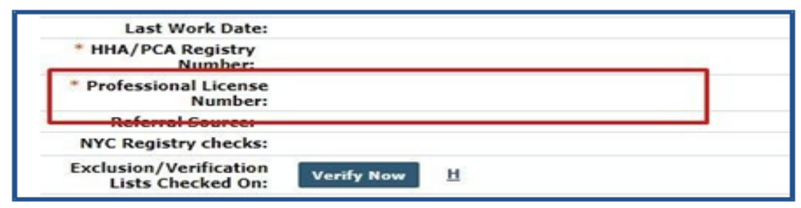
Caregiver Profile Page: Professional License Number

Beginning May 1, 2023, the Caregiver Medicaid Identification Number (ID) MUST be present on the caregiver profile in the "Professional License Number" field. To support this requirement, HHAeXchange (HHAX) will enable the "Caregiver Professional License Number" Billing Review Setting for all invoices intending to be billed to Empower Healthcare Solutions.